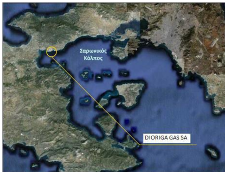
Figure 1 Dioriga FSRU Location